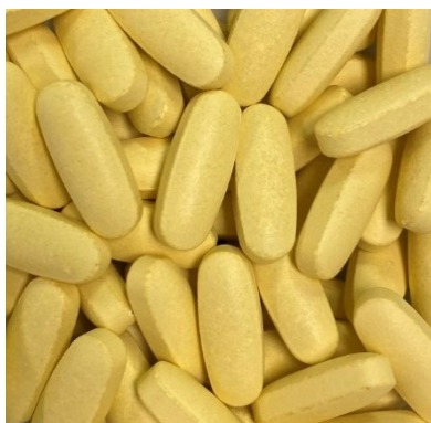
2a) 3% WG Nutrafinish TiO 2 Free Coating