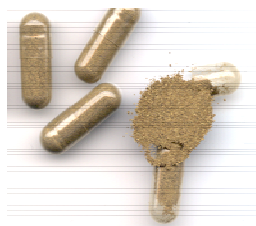
Traditional Dosage Form