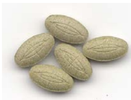
Compressed to Tablet