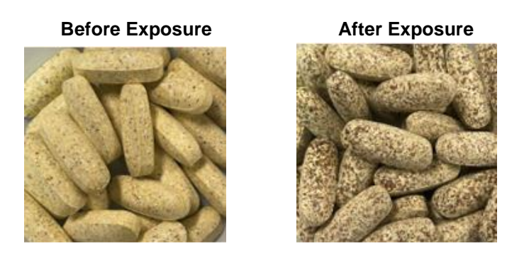
Figure 2. Color Difference (DE) for Tagged and Untagged APAP Tablets Following Storage for 6 Months at 40°C/75% RH