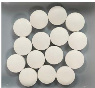
Figure 2: pH-Independent Drug Release of Coated Caffeine tablets