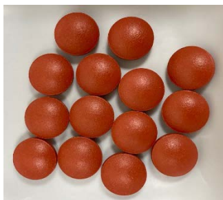
Figure 2: Drug Release from Coated Vitamin C Tablets