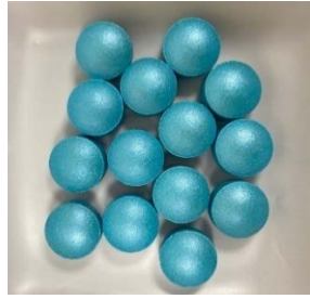
Figure 1: Film Coated Valerian Root Extract Tablets