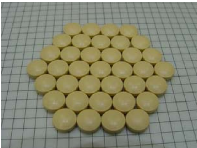
Figure 3. Coated Tablet Appearance (10% Weight Gain)

The coating process for each of the six trials ran smoothly with no difficulties. Visual examination of the tablets after coating revealed no signs of edge defects or other tablet damage. Edge defects were a concern due to random tablet impact with other tablets and various machine surfaces. The Acryl-EZE coated tablets exhibited exceptionally smooth and glossy surfaces (Figure 3).