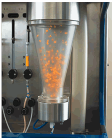
Figure 1. Tablet Movement

In the Supercell process individual batches of 15 to 100 grams of tablets or capsules can be coated concurrently with heated drying air. The tablets are rapidly rotated as they pass through the coating zone ensuring intimate contact with the coating material (Figure 1).