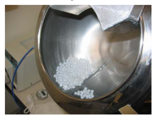
Figure 1. Photos of Tablets Tumbling in the Conventional Stainless Steel Pan

In the laboratory scuffing test method, film coating formulations (PVA-based) with various levels of TiO<sub>2</sub> (anatase form) were evaluated. Standard round 9 mm placebo tablets, pre-coated to a 3% weight gain (WG), were placed in a 16" stainless steel conventional pan and rotated at 20 rpm. At five-minute intervals up to 30 minutes, all tablets were removed and visually inspected under magnification for scuffing related defects on both sides of the tablets. An acrylic box was constructed to facilitate the inspection of the tablets (Figures 1-4). The number of scuffed tablets per time point was plotted and compared for each formulation.