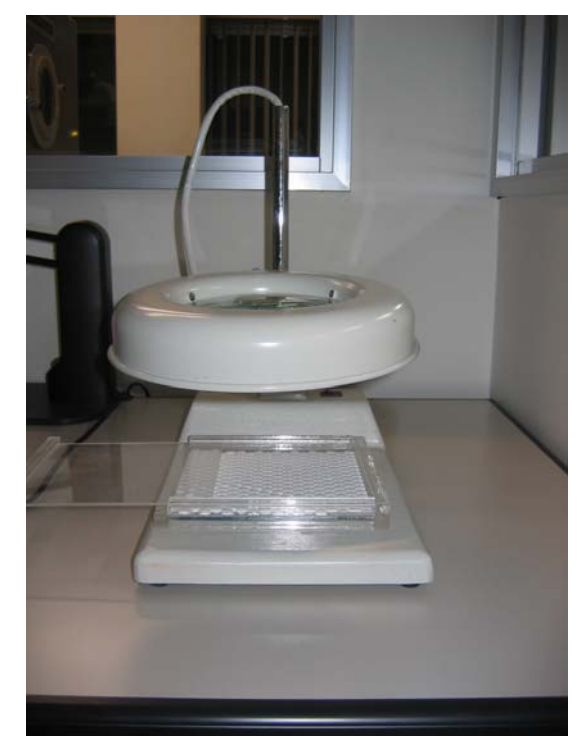
Figure 3. Apparatus for Inspection of Tablet Samples