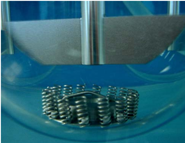
Figure 3. Use of a Novel Sinkers for Dissolution Testing of Enteric-Coated Mini-Tabs