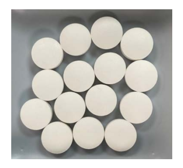
Figure 1: Film Coated Caffeine Tablets