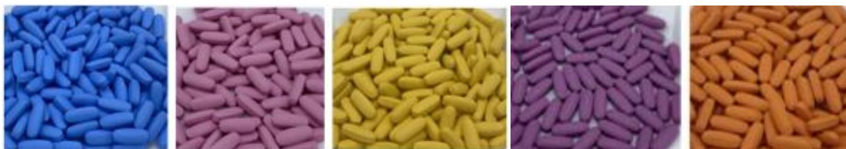
Figure 3. Multivitamins Coated with Nutrafinish Label Friendly Systems Containing a Plant Based Opacifier

This demonstrates the advantage associated with calcium carbonate-free opacifiers for the color development of film coating systems with natural pigments.